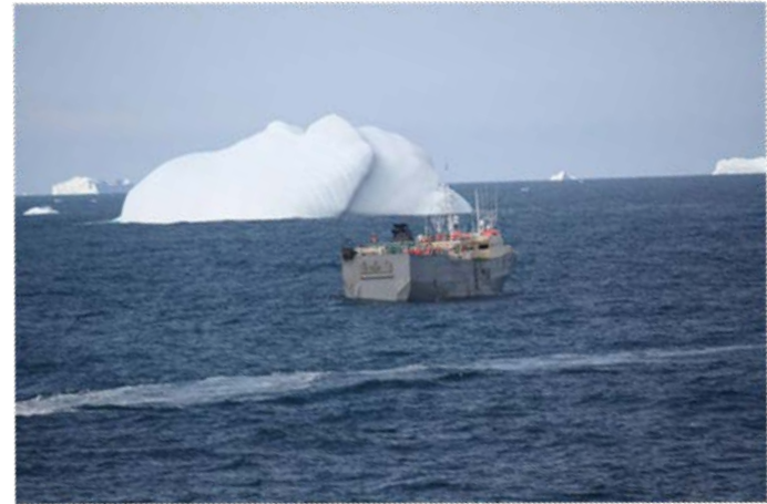
NON-CONTRACTING PARTY IUU VESSEL LIST (CM 10-07) ADOPTED 2003 – 2011

Names and flags under which the vessels were originally listed are underlined